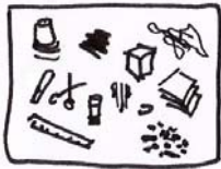
Figure 2. 'Materials' cover physical things, papers, tools, etc etc which are more or less off the shelf but generally still open-ended. They can be combined and attached a variety of meanings depending on the decided focus and aim.

'Material Means' is an overall term used as a synonym to all the other names mentioned in the introduction. It is chosen because it indicates the importance of focusing on what the used Materials really Mean as part of an ongoing design process. A focus on meaning, which seems in line with the new foundation for design that Klaus Krippendorff suggests in his latest book 'The Semantic Turn'. [8]