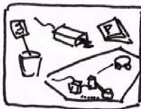
Figure 4. 'Materialized' cover the Material representations resulting from the process of 'Materializing'. They are either produced before or during the activity (by one or more producers), are not likely to be much further physically modified, but are explored and used during (and maybe after) collaborative sessions and therefore get to hold some shared implicit meaning among the participants.