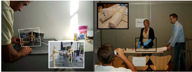
Figure 7. ‘Materialized’ mock-ups and other supportive ‘Material Means’ used for exploring and staging possible use situations either in miniature (left) or full-scale (right).

storyboards, role playing and experience prototyping are also widely accepted PD methods for encouraging engaged collaboration. [e.g. 4] Very often the two techniques are intervening and before a scenario can be played various ‘Material Means’ e.g. mock-ups has to be produced to set the scene and equip the actors.