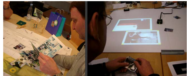
Figure 6. 'Materialized' User insights e.g. as cartoons, ill. transcripts, scaled down context models, used artifacts, image-cards maybe with video-links, etc - here collected in appealing 'fieldpacks' (left) and/or used in design-oriented games (right).

Logically end users cannot participate all the time or share their experiences with everyone, and within PD it is now quite common to also combine various methods e.g. of ethnographic studies and the use of probes as ways of gaining user insights. [9,6] A challenge is still how to share all this knowledge with other team members. Reports, posters, stories etc are useful but in some sense one-way communication. In some of the projects from which these experiences are based, we explored how various quite open-ended 'Materialized' formats could involve other professions in engaging ways during collaborative sessions. [1]