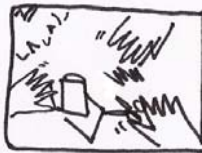
Figure 3. 'Materializing' cover the process of designing, exploring and giving specific meaning to the 'Materials' being used. Some kind of facilitation and/or previous agreement is usually needed to focus the activity.