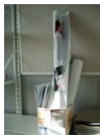
Figure 1. The aim is to avoid that the physical representations just end up maybe as a fun memory but packed in a box.

Among a few within research e.g. Capjon argues for a trial-and-error-based approach by using 3D-scanning and Rapid-Prototyping to collaboratively work on variations and details of a design object [3] and Brandt has been exploring ways of focusing on 'Continuity' when working with representations in Event-driven Development. [2]