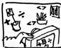
Figure 5. 'Re-Representing' covers the explicit process of abstracted analysis, taking different perspectives, and making design-oriented decisions e.g. by critically relating [+ -], comparing [ < > ], and possibly transforming the 'Materialized' to modified formats.

Formats like annotated photos, digested diagrams, movies, annotated mock-ups, sketched comparisons, etc etc which are likely to also get a life in the ongoing iterative design process. Depending on the nature of the activity this can happen preferably along the way, towards the end of a session, or as a separate explicit collaborative activity.